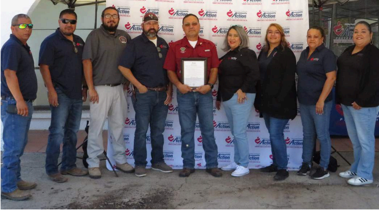
The Weatherization team celebrated "National Weatherization Day," with an Open House and Proclamation reading by Uvalde Mayor Pro Tem, Lalo Zamora.