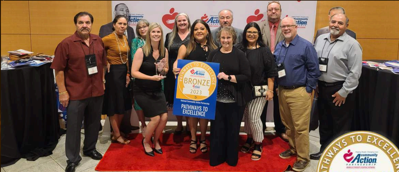
Pathways to Excellence Bronze Designation