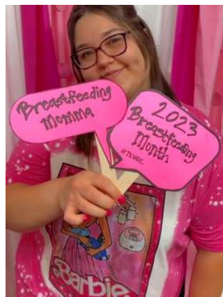
This Barbie makes a difference!