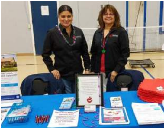
Comal County Coordinators support the Foodbank Community Resource Fair.