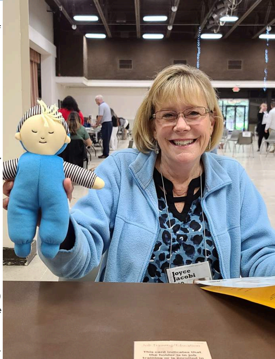
A volunteer plays, "Joyce Jacobi" - a single mother trying to make ends meet for her baby during our eye-opening, "Poverty Simulation." The event gave participants an impactful experience through a day in the life of a family in poverty.

Bandera, Bee, Brewster, Comal, Culberson, Crane, Dimmit, Edwards, Frio, Gillespie, Guadalupe, Hudspeth, Jeff Davis, Karnes, Kendall, Kerr, Kinney, LaSalle, Live Oak, Maverick, Medina, McMullen, Pecos, Presidio, Real, Terrell, Uvalde, Val Verde, Wilson and Zavala. It should be noted that each program may be authorized by its funding source to serve either additional counties or less than the counties specified.