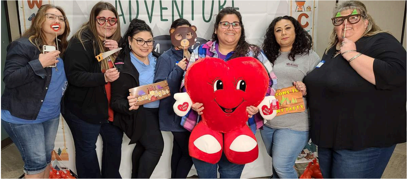
WIC staff at our Annual All-Staff Training!