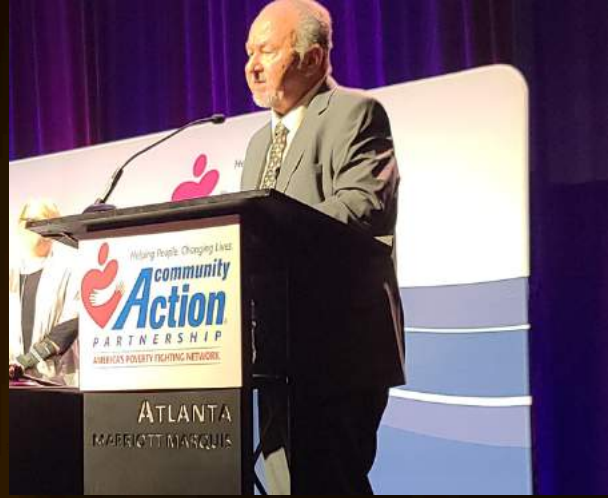
NCAP Inaugural Community Action Reacts and Responds Award