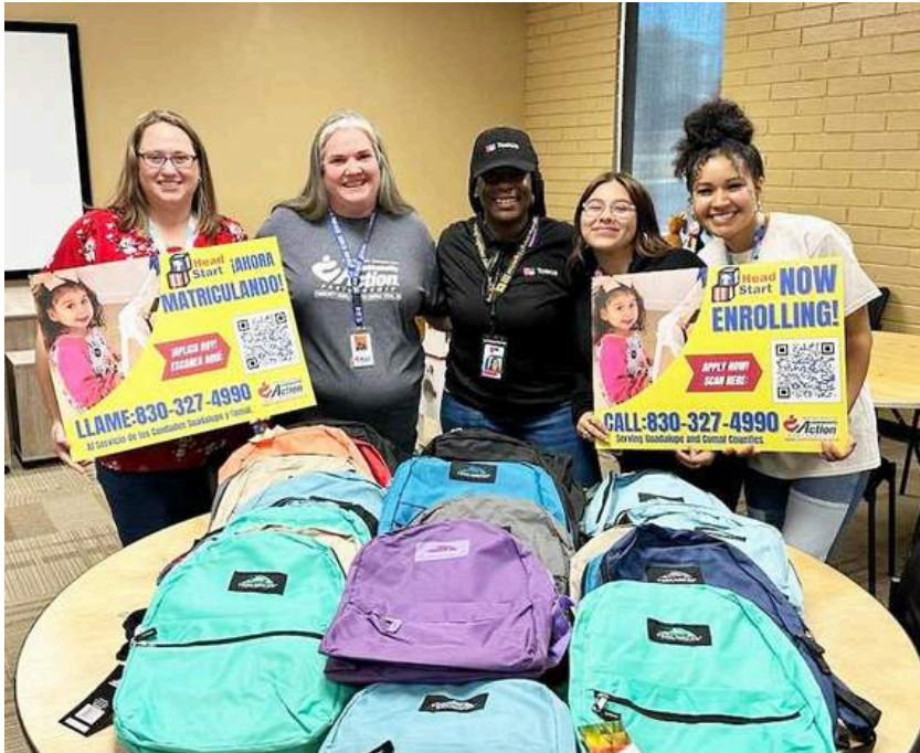
TaskUs North America ensured Head Start kiddos were ready for school with new backpacks and school supplies!