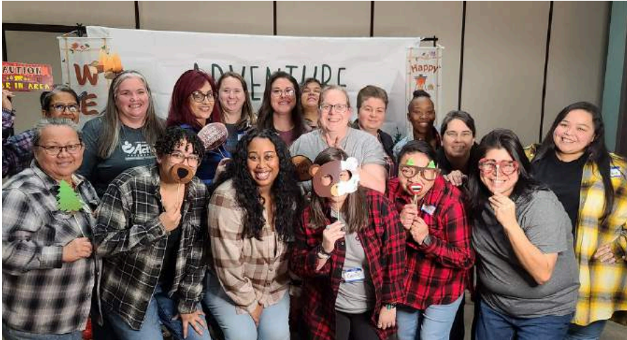
CCSCT Head Start group photo during our All Staff Training Day.