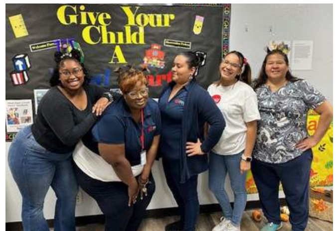
HS Staff get together for a quick picture during, "Crazy Hair Day!"