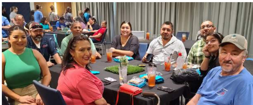
Taking a break during Staff Appreciation Day at Top Golf !