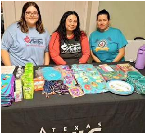
The WIC team at a community outreach event.