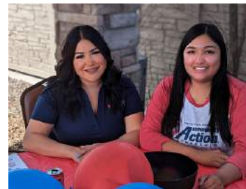
Weatherization Day in Uvalde and Fort Stockton!